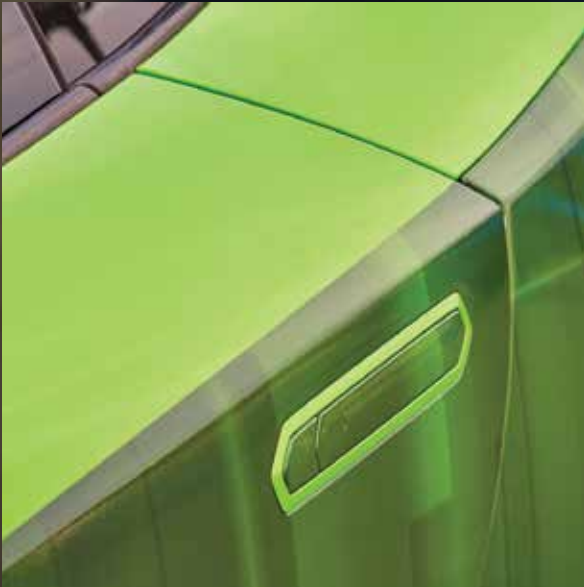
▲ Green vehicle colour shows through film and is part of the design.